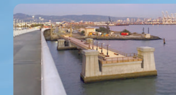
Bay Observation Pier, Judge John Sutter Regional Shoreline