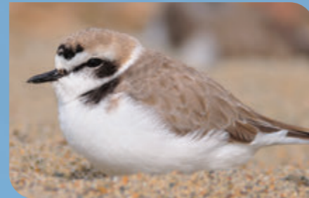
Western Snowy Plover

The Park District also continues to evaluate the impacts of climate change on Regional Parks, including leading a regional study to assess the impacts of sea-level rise on the Bay Trail; and working on a joint Hayward Shoreline Master Plan with the City of Hayward and Hayward Area Recreation and Park District to evaluate sea-level rise impacts and possible solutions along the Hayward shoreline.