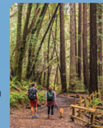
Reinhardt Redwood Regional Park, Oakland