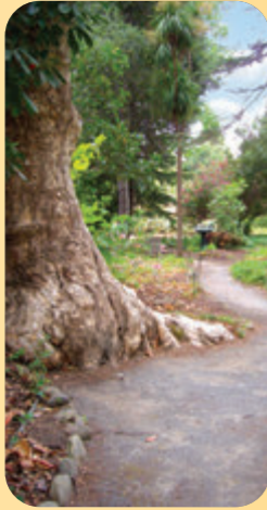
Dry Creek Garden