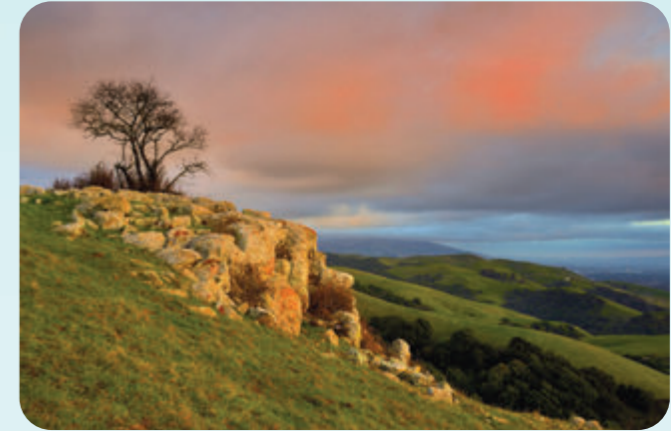
Views from Dry Creek Pioneer Regional Park