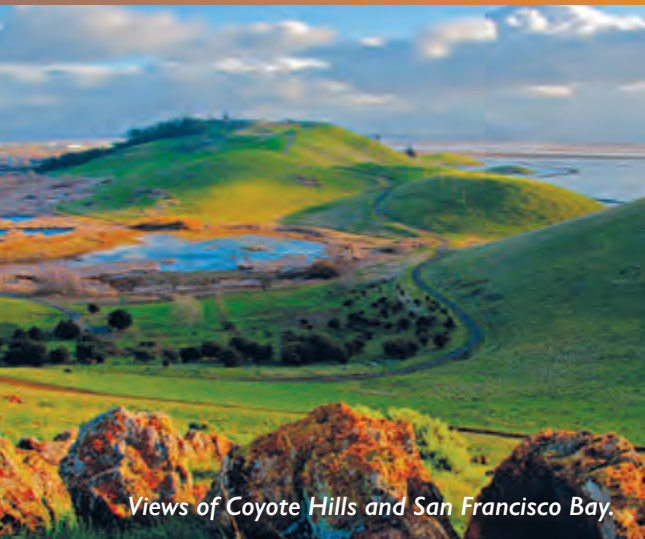
Views of Coyote Hills and San Francisco Bay.