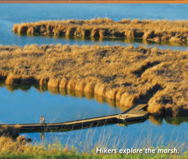
Hikers explore the marsh.