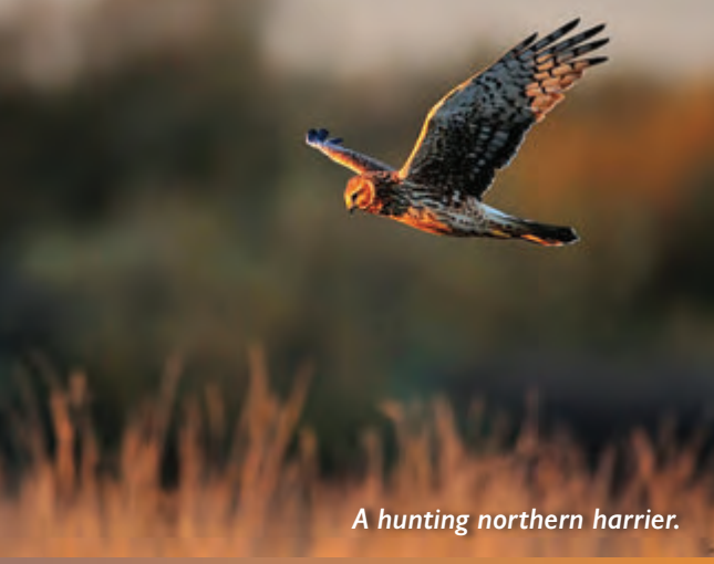
A hunting northern harrier.