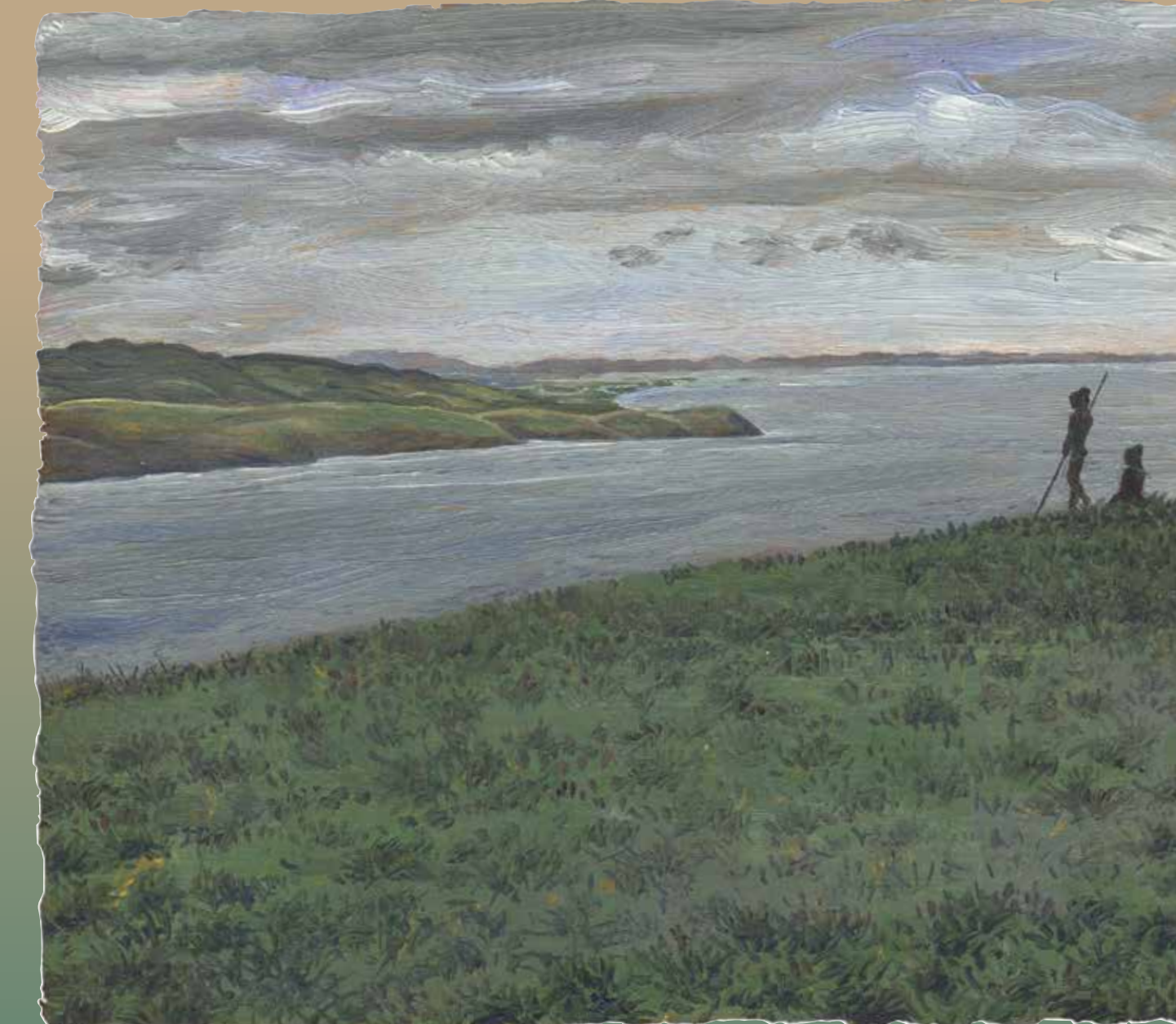
View across the Carquinez Strait (located behind you): winter, 1700

The channel on your left is Alhambra Creek, the ultimate outflow of the watershed that bears its name. Three hundred years ago, native peoples lived and thrived in this watershed. Today we have a very different relationship with the land. Most of us go in and out of our home watershed as we live our daily lives. Nearly forgotten is the intimate knowledge of the plants, animals and yearly rhythms of the landscape that sustained the first people here.