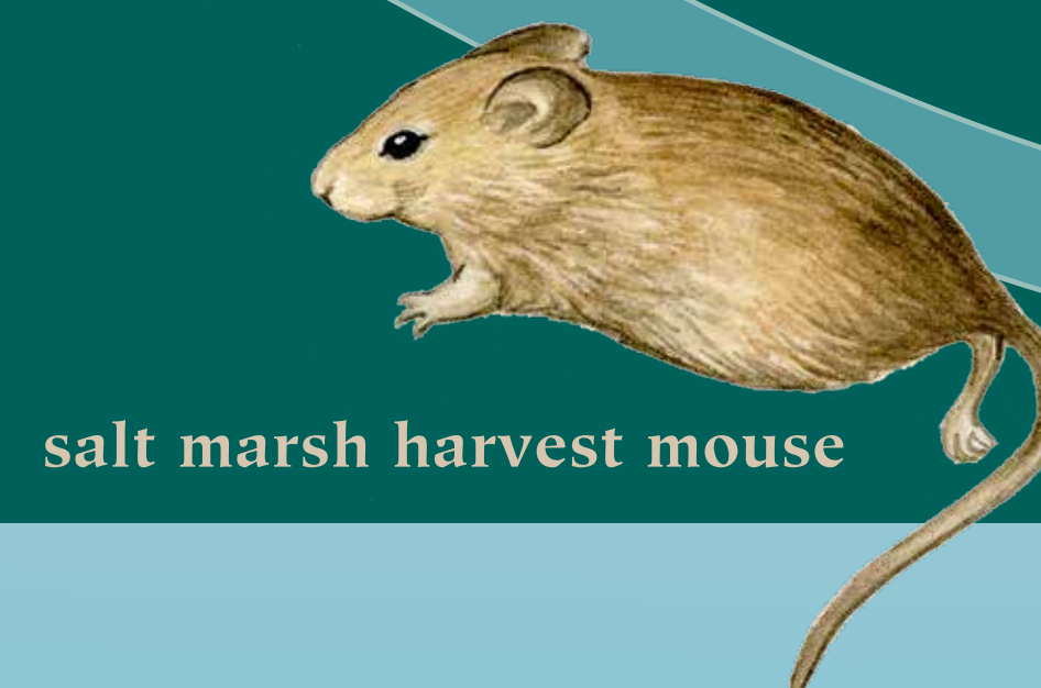
salt marsh harvest mouse